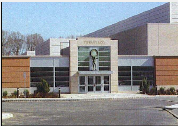
Tiffany and Company's new Customer Fulfillment Center at 141 Parsippany Road in Hanover/Whippany

MHSNJ WILL TOUR NEW FULFILLMENT CENTER MARCH 24TH